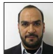
Al Alhaji System Ops Analyst